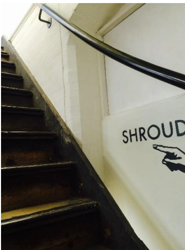
Stairs leading to second floor

Just outside is a staircase leading to the Shroud Room on the second floor. This is a steep staircase with a handrail. Or you can use the lift. The lift is located by walking through The Warehouse and Gallery Space.