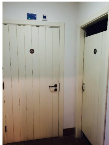
Accessible and ladies toilet (ground floor)