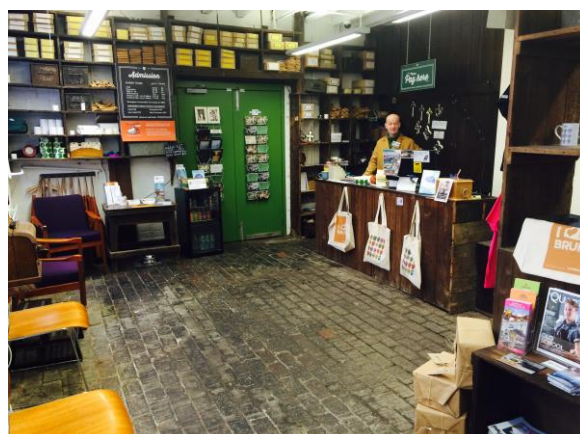
Reception and Shop