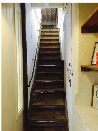
Stairs leading to first floor

You can either walk up the stairs (which are steep) or take the platform lift. You exit the lift on the first floor and go through the Gallery Space into The Warehouse.