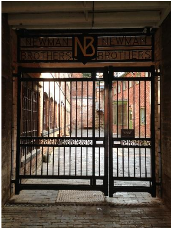
Inner metal gates