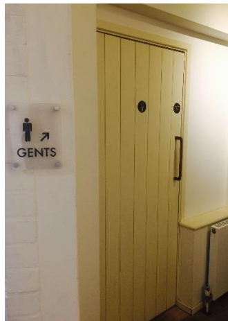
Gents toilet (first floor)